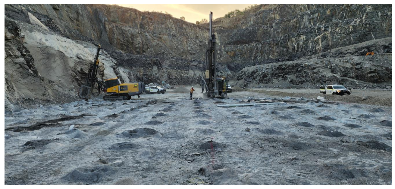
Figure 1 - Orana Drilling Blast Holes

A grade control model has been commenced and to date is showing good correlation to the resource model, with expected ore grade being defined in the current zones drilled. This is a huge positive to see these extending upward to surface from the original diamond hole drill programs and continues to help better define our geological models.