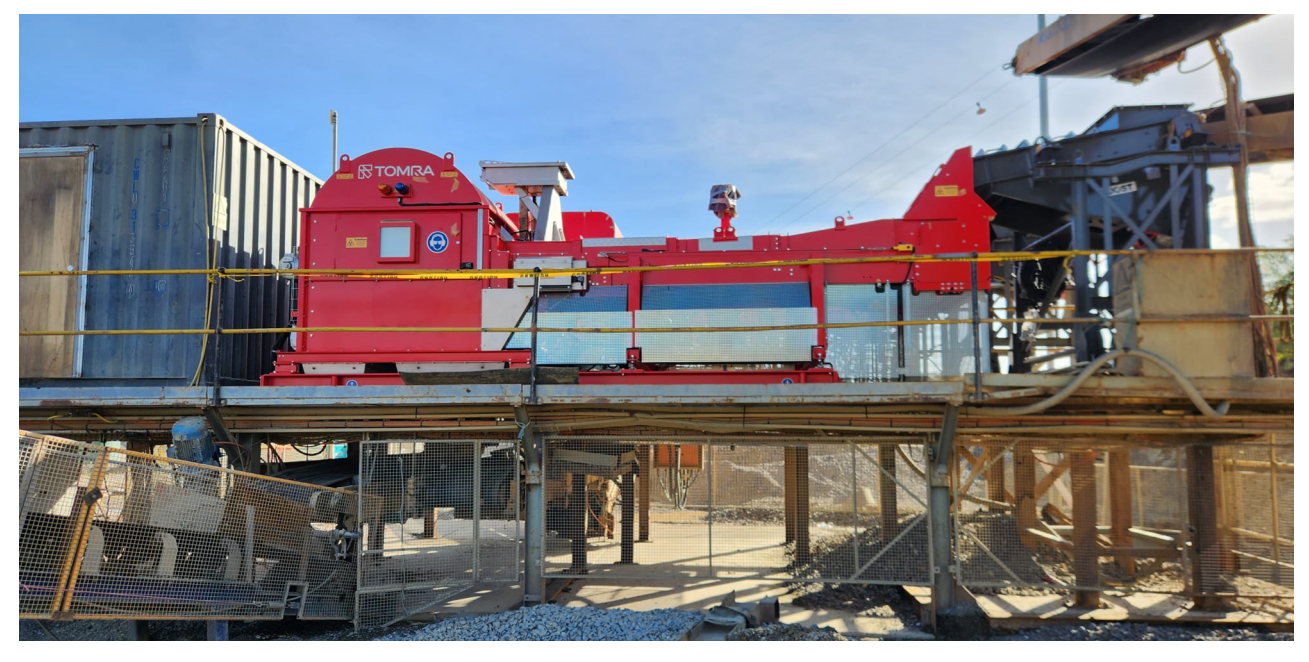
Figure 3 – Final positioning of TOMRA 3