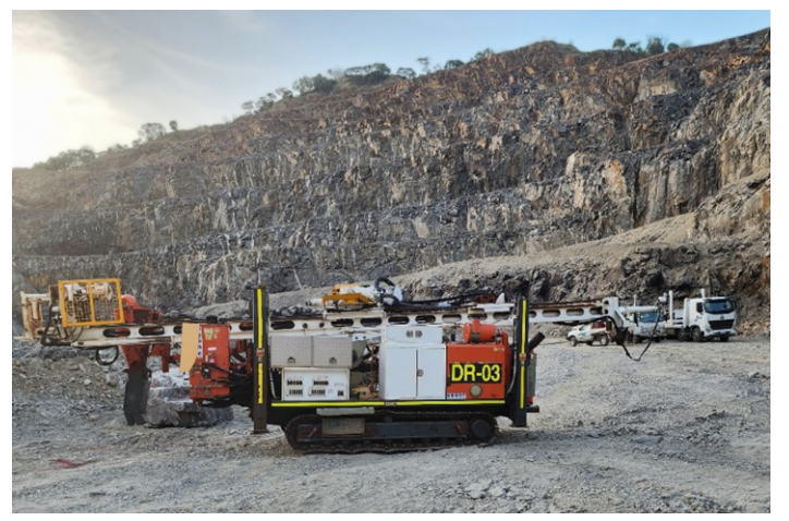
Fig. 2 - Grade control Drill Rig in the Mt Carbine Andy White Open Pit

The drill plan considers 145 RC holes with an average depth of 45m, with sampling and analysis to be completed on 1m downhole intervals.