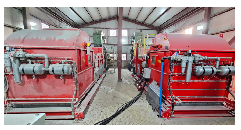
Fig.1 - XRT Sorting Plant fully commissioned; 2x Tomra XRT Sorters (COM Tertiary XRT 1200)

The XRT Sorting Plant has been added to Saloro's processing circuit in late 2023 only, benefiting from the experience the Company gained at its Mt Carbine Operation. The previous process setup at Saloro discarded any ore with sizing >6mm given post crushing, tertiary the corresponding grade below 0.06% WO3 was considered uneconomic for further processing. During ramp-up, the XRT Sorting Plant achieved ore grade upgrades of >25-times, with a sorter feed grade of below 0.06% WO<sub>3</sub> processed into a sorter concentrate with a grade of 1.5-2% WO<sub>3</sub>.