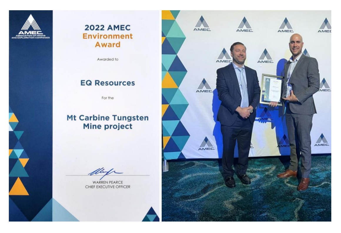
Figure 1: EQR won the 2022 AMEC Environment Award in recognition of its sustainable mining practices.