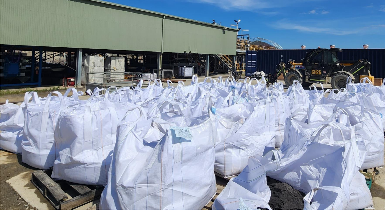
Figure 3: Approximately 25 of the 110 bags of Tungsten Concentrate produced in July on the pad, sold ex-gate and ready for transport.

Mt Carbine's Tungsten concentrate is bagged and transported by road to the Port of Townsville and on to global customers through existing sales arrangements. EQR looks forward to reporting on September quarter revenues in its ASX report.