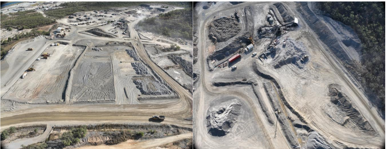
Figure 4: The Mt Carbine and Golding team have optimised the site layout to facilitate increased production and workflow activity.