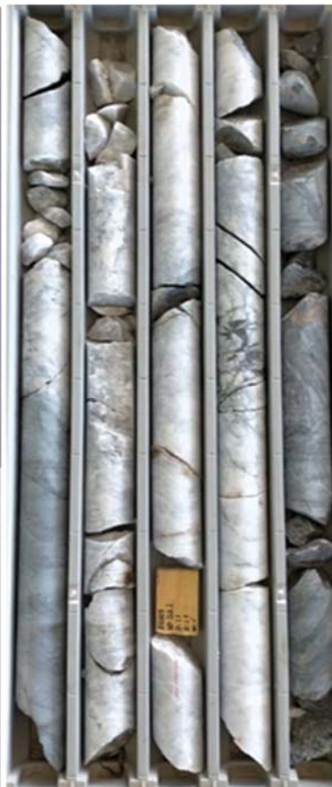
Drill Core – Hole EQ006: ⊗ from 124-128.5m depth in the Iolanthe Vein